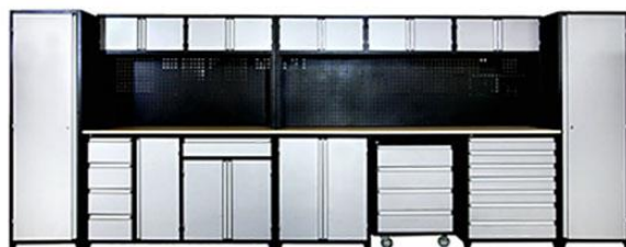
Garage Cabinet Series