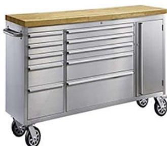
Stainless Tool Cabinet